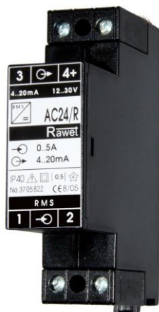
AC24/R - true RMS value